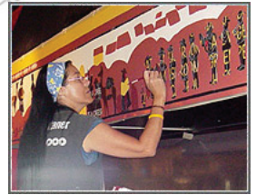
Painting a mural in the restaurant of Aji