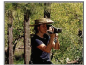
Shooting of video in Argentina